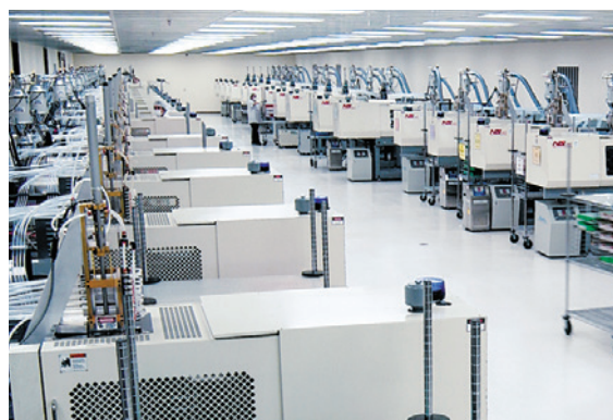
Class 100,000 clean room manufacturing