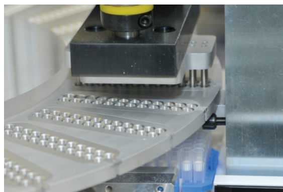
Automated filter assembly, no human contact