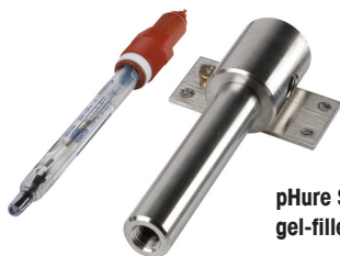
pHure Sensor with pressurized gel-filled reference system

Pressurized gel-filled electrodes provide more stability of the reference diaphragm/junction potential by forcing a small amount of potassium chloride gel through it. The METTLER TOLEDO Thornton pHure Sensor™ system offers this type of electrode. It requires no maintenance other than occasional calibration throughout its one-year life.