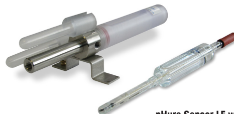
pHure Sensor LE with liquid electrolyte reference system

Liquid electrolyte electrodes provide the highest accuracy of measurement by maintaining a steady flow of liquid electrolyte through the junction/diaphragm. It requires refilling the liquid electrolyte periodically and can have a life of several years. The METTLER TOLEDO Thornton pHure Sensor™ LE has this capability, plus it includes convenient buffer calibration containers built-in.